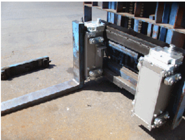
Scales Installed and Right Fork Re-Attached

This "first-time installation by an inexperienced worker" took less than ten minutes, total.